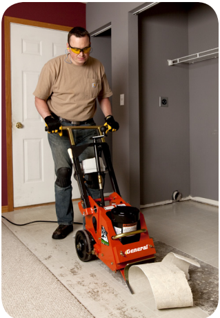
Scoring blades cut sheet-type covering materials into 8" wide strips.