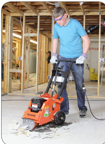
FCS16 Removing VCT from concrete.