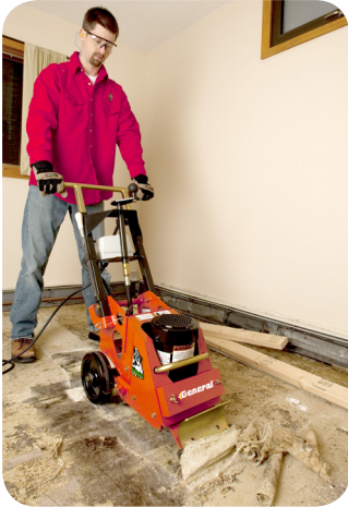
Mastic removal blades scrape mastics, glues, etc from concrete.